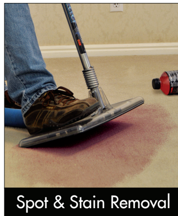
Spot & Stain Removal