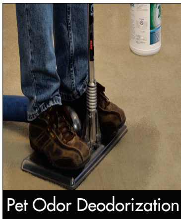
Pet Odor Deodorization